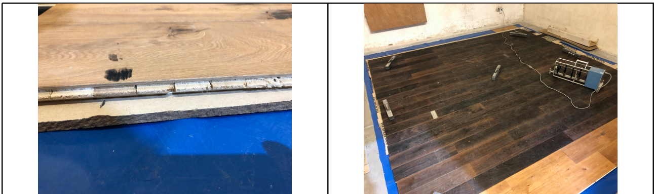
Illustration / drawing for sample assembly